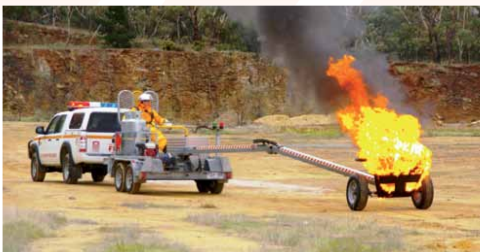
Running Grass Fire Simulator in Action up at Brukunga.

A mixture of CFS volunteers and contractors worked on the prototype,