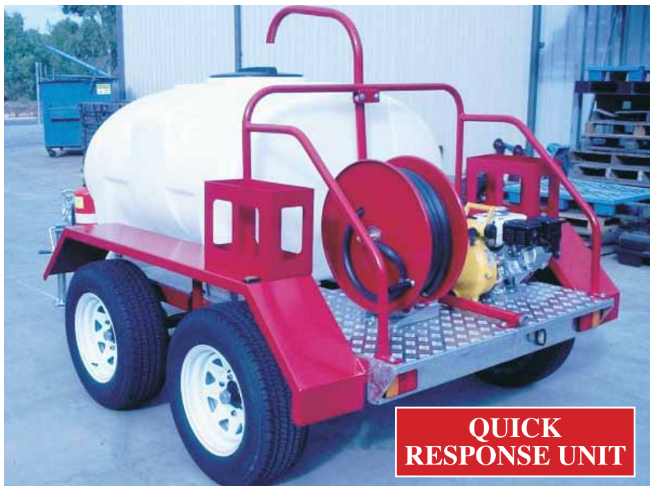
Trailer mounted fire fighting units.

All units can be configured to the customer's personal requirements/specifications. From the simplest configuration of a single axle, tank, pump and hose reel up to a dual axle fully equipped unit.