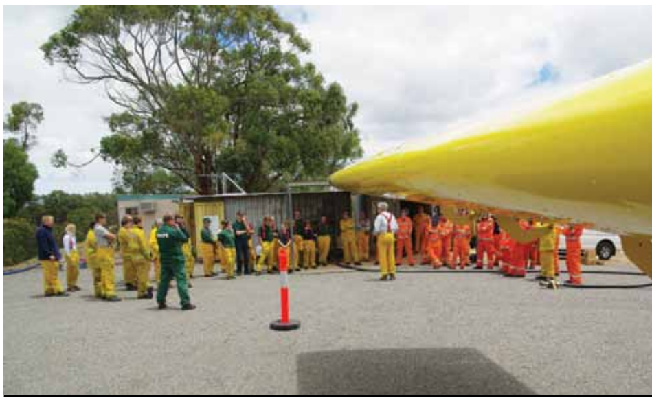
Crews undertaking a briefing before practical training starts.

Aviation Services would like to thank everyone for their support during the fire season.