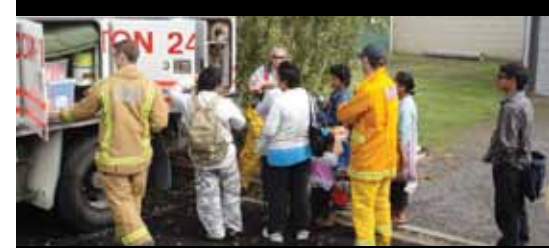
A Compton CFS fire truck draws attention on Harmony Day in Mount Gambier.