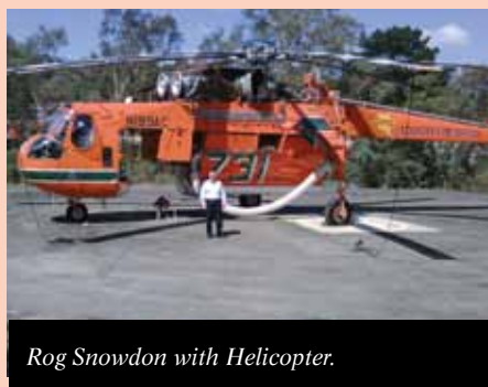
Rog Snowdon with Helicopter.