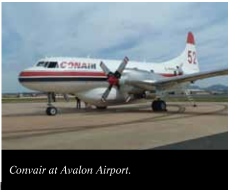
Conair at Avalon Airport.