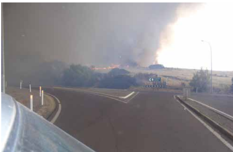
An image of what travellers may be faced with on a day of high fire danger.

The Show is run by the Caravan and Camping Industries Association of South Australia (CCIASA), who represent South Australian traders in the outdoor leisure industry. CCIASA promotes the broad industry within the state and also works to improve the welfare and business success of its