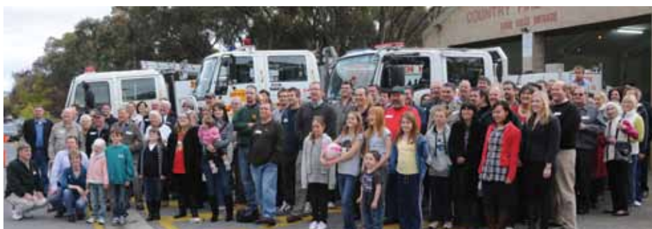
Group shot of Anniversary attendees.

"While the threat of natural disasters such as bushfires, floods and storm related incidents continues to grow, urban development, busier road traffic and the use of hazardous materials has