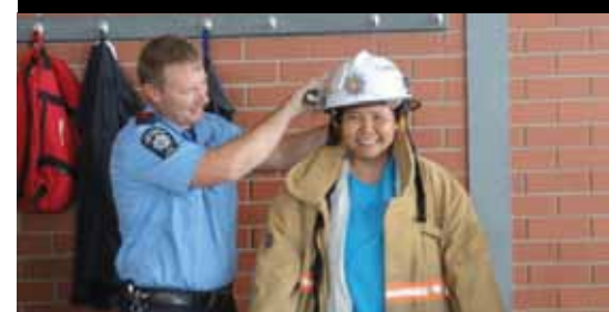
A Harmony Day participant tries out a firefighting outfit.