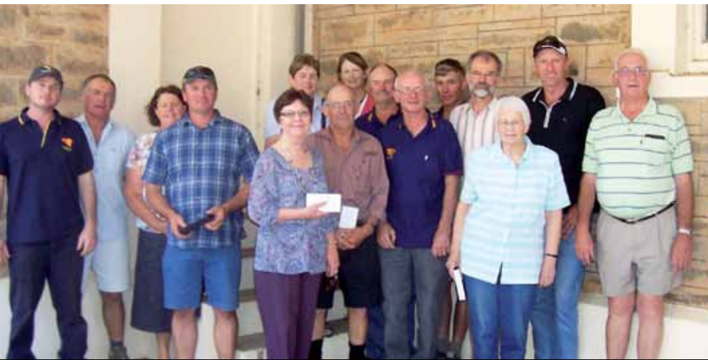
Servers over past 40 years.