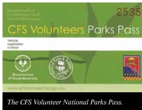
The CFS Volunteer National Parks Pass.

We have plenty of passes left, so get your application in. We have received very positive feedback from those members that are using their passes.