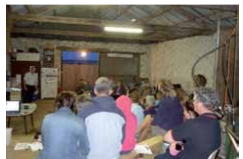
Bramfield residents learn about CFS responses to bushfires.