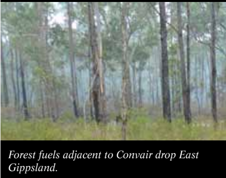
Forest fuels adjacent to Conair drop East Gippsland.