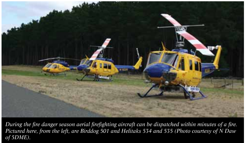
During the fire danger season aerial firefighting aircraft can be dispatched within minutes of a fire. Pictured here, from the left, are Birdog 501 and Helitaks 534 and 535.

sitting at airbases just waiting. Whatever the fire season this next summer brings, CFS Air Ops will again be well prepared and ready for action.