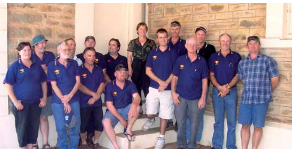
Tarlee CFS current members @ 40 year celebration.