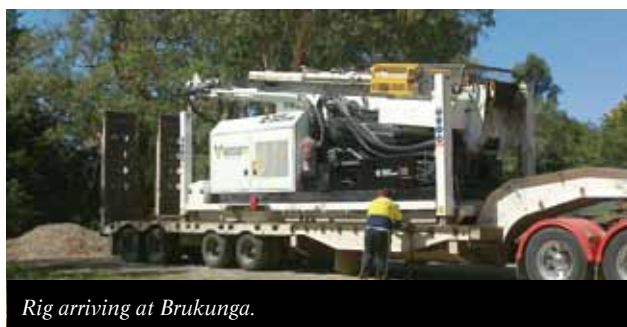
Rig arriving at Brukunga.