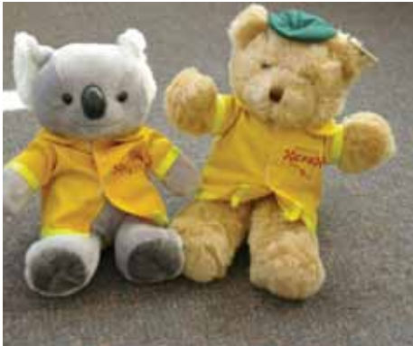
The gorgeous teddies for sale!

T he CFSVA now has two cuddly friends for sale to members. In addition to our Trauma Teddies, we now have Smokey Koalas for sale at $20 each. And as a winter special we will also sell the teddies at the reduced price of $20 until the end of September. Both prices are inclusive of GST.