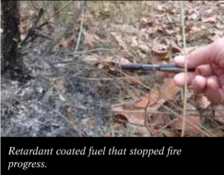
Retardant coated fuel that stopped fire progress.