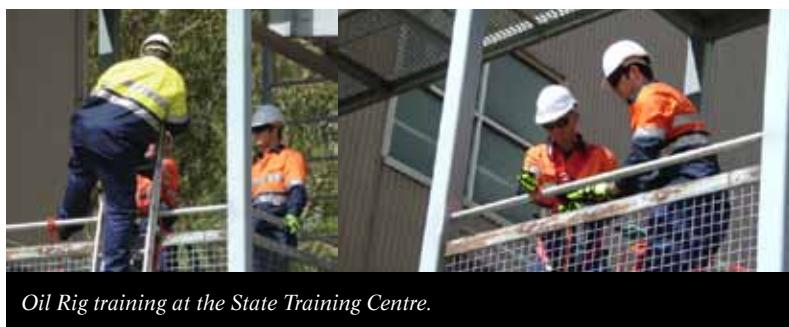
Oil Rig training at the State Training Centre.