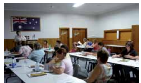
West Coast Home Care staff take part in a fire safety training session.